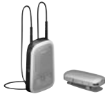
Phonak ComPilot / Phonak RemoteMic