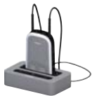
Phonak TVLink S / Phonak ComPilot