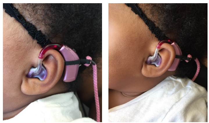
Figures 4. A loose fitting hearing aid with a standard earhook (left). An improved hearing aid fitting in which a mini earhook is used to improve positioning, retention and comfort over the ear (right).

Both standard and mini earhooks are available with a 680 filter to provide a smoothed frequency response in this frequency region. This filter is recommended because it smooths peaks that lead to feedback and makes it easier to optimize the maximum power output (MPO) of the device (Scollie and Seewald, 2002). It is important to note that these acoustic damping elements are made of absorptive fibers that can get damp or clogged. A water-logged filter can produce a muted response or even block the sound channel all together, leading one to believe that the hearing aid is nonfunctional. When troubleshooting, it is important to remove the hooks to ensure that the filter is not impeding performance. All Phonak BTEs are compatible with a mini earhook and tamperproof mini earhook. For additional piece of mind, all Phonak tamperproof accessories are designed to prevent small hearing aid parts from being removed and ingested by children and to comply with IEC standards. A small tool is needed to unlock the pediatric tamperproof earhook from the BTE (Figure 6). The earhooks are available in 6 colors (Figure 7) to make the selection of hearing aids more fun and appealing to children. They can also be changed at home and are an inexpensive way to personalize the hearing aids.