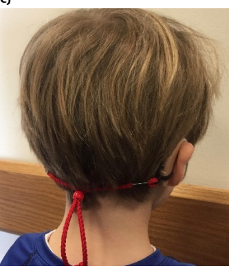
Figure 11. Retention solutions for babies include: a) pilot cap with mesh sides b) headband with sleeves, c) retention straps.