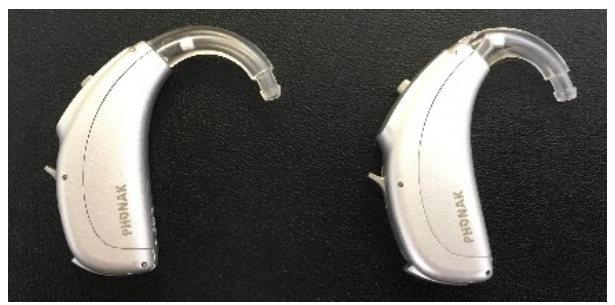
Figure 5. A BTE with a standard HE 10 680 hook (left) and a HE 10 680 mini hook (right).

A BTE style hearing aid requires that sound be channeled from the loudspeaker into the ear canal. Earhooks and tubing coupled to a traditional earmold are the most common coupling choices with BTE devices. Standard size earhooks often result in a floppy, loose fitting on little ears. Figure 4 shows examples of a young child with a loose fitting hearing aid with a standard size earhook and an improved fit using a pediatric size earhook. Pediatric "mini hooks" are suggested for use with infants and young children because they are shortened with a tighter curve over the ear to support hearing aid retention and optimal positioning. A comparison of the two types of earhooks is illustrated in figure 5.