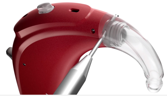
Figure 6. The Phonak tamperproof earhook being unlocked with the tool