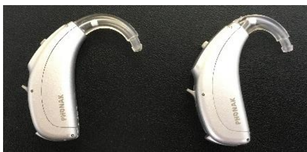
Figure 5. A BTE with a standard HE 10 680 hook (left) and a HE 10 680 mini hook (right).

Both standard and mini earhooks are available with a 680 filter to provide a smoothed frequency response in this frequency region. This filter is recommended because it smooths peaks that lead to feedback and makes it easier to optimize the maximum power output (MPO) of the device (Scollie & Seewald, 2002). It is important to note that these acoustic damping elements are made of absorptive fibers that can get damp or clogged. A water-logged filter can produce a muted response or even block the sound channel all together, leading one to believe that the hearing aid is nonfunctional. When troubleshooting, it is important to remove the hooks to ensure that the filter is not impeding performance. All Phonak BTEs are compatible with a mini earhook and tamperproof mini earhook. For additional piece of mind, all Phonak tamperproof accessories are designed to prevent small hearing aid parts from being removed and ingested by children and to comply with IEC standards. A small tool is needed to unlock the pediatric tamperproof earhook from the BTE (Figure 6). The earhooks are available in 6 colors (Figure 7) to make the selection of hearing aids more fun and appealing to children. They can also be changed at home and are an inexpensive way to personalize the hearing aids.