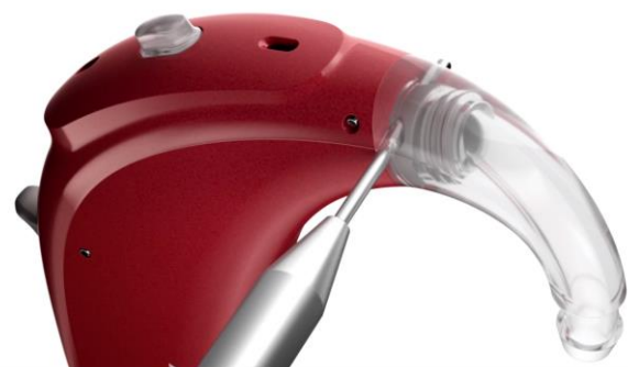
Figure 6. The Phonak tamperproof earhook being unlocked with the tool

Both standard and mini earhooks are available with a 680 filter to provide a smoothed frequency response in this frequency region. This filter is recommended because it smooths peaks that lead to feedback and makes it easier to optimize the maximum power output (MPO) of the device (Scollie & Seewald, 2002). It is important to note that these acoustic damping elements are made of absorptive fibers that can get damp or clogged. A water-logged filter can produce a muted response or even block the sound channel all together, leading one to believe that the hearing aid is nonfunctional. When troubleshooting, it is important to remove the hooks to ensure that the filter is not impeding performance. All Phonak BTEs are compatible with a mini earhook and tamperproof mini earhook. For additional piece of mind, all Phonak tamperproof accessories are designed to prevent small hearing aid parts from being removed and ingested by children and to comply with IEC standards. A small tool is needed to unlock the pediatric tamperproof earhook from the BTE (Figure 6). The earhooks are available in 6 colors (Figure 7) to make the selection of hearing aids more fun and appealing to children. They can also be changed at home and are an inexpensive way to personalize the hearing aids.