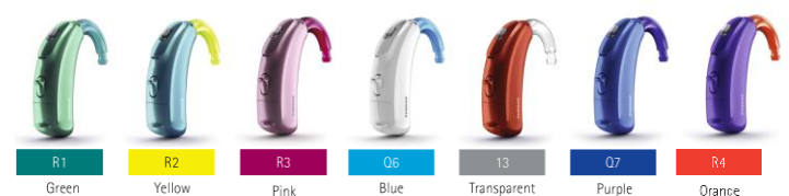
Figure 7. Phonak standard and tamperproof mini earhooks are available in 6 colors and a transparent option to personalize pediatric hearing aids.