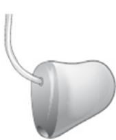
Fig.1 cShell - standard tube

We offer an alternative cShell build style with an anterior tube outlet. This build style provides high cosmetic acceptance in spite of a slightly larger size and can be used in case of build problems due to anatomical limitations. This build style is available for acrylic shells only.