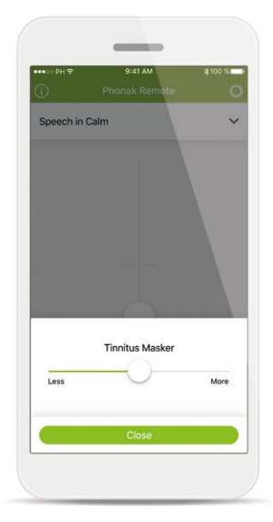
Tinnitus Noiser intensity