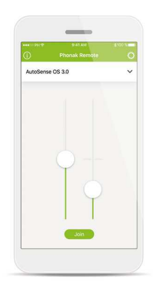
Volume adjustment for each side

For videos on how to use and setup the Phonak Remote app on your phone, please visit www.phonakpro.com/remoteapp