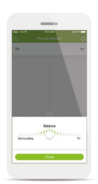
Environmental balancing of an audio stream