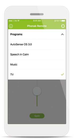
Program selection and customization