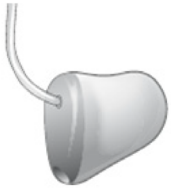
Fig.1 cShell - standard tube

We offer an alternative cShell build style with an anterior tube outlet. This build style provides high cosmetic acceptance in spite of a slightly larger size and can be used in case of build problems due to anatomical limitations. This build style is available for acrylic shells only.